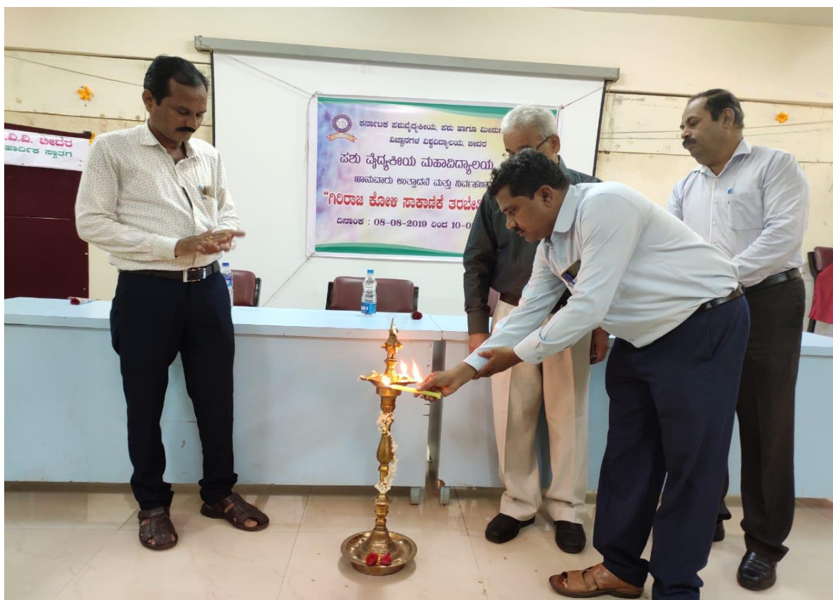
Inauguration of backyard poultry training programme

Restrictions on movement of people during the lockdown resulted in a situation where farmers were not in a position to visit farm advisory and solution centres such as KVKs, veterinary college, etc. Also, COVID-19 and subsequent lockdown prevented direct contact with farmers; trainings/direct interactions were affected. Although Veterinary College, Bidar, has been organizing training programmes and giving hands-on trainings for the benefit of farmers, all the activities were stopped due to lockdown. The trainings and demonstrations focused on management aspects like brooding, nutrition, common diseases and their prevention, vaccination, etc. The farmers from Bidar district, its neighbouring districts and neighbouring states were also affected as Bidar is located close to Maharashtra and Telangana borders.