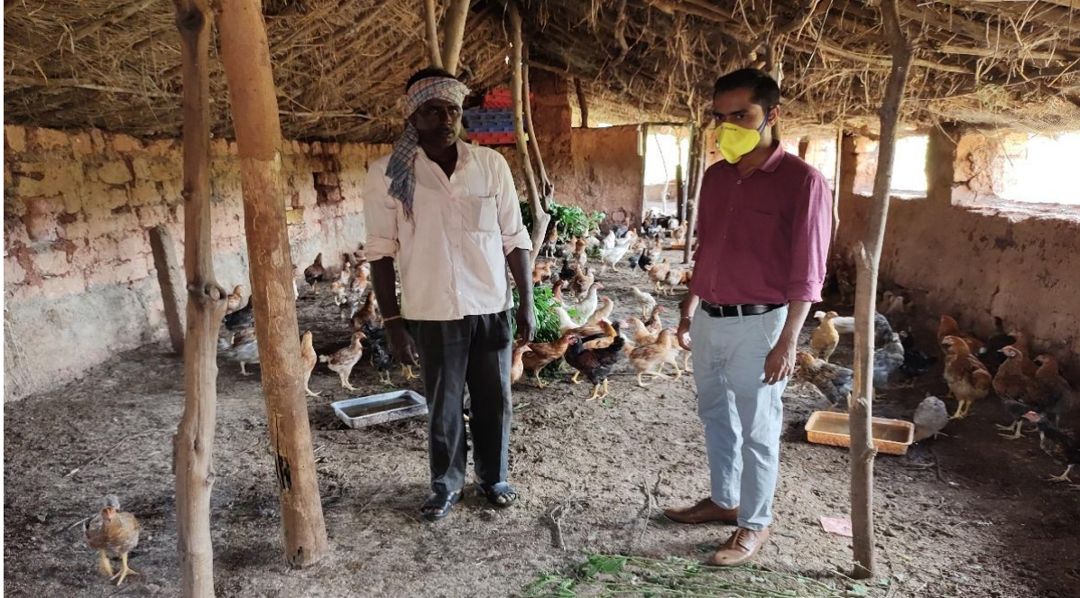
Field visit by experts of Veterinary College, Bidar

As this hatchery unit has a revolving fund and is not supported through ongoing projects, it was difficult for the experts to visit the farm or farmers in villages. This is also a common problem for majority of the government institutions bound by several rules and regulations for budget expenditure. However, upon request by the nearby farmers, field visits were conducted with all precautionary measures by the concerned personnel to address issues in field conditions.