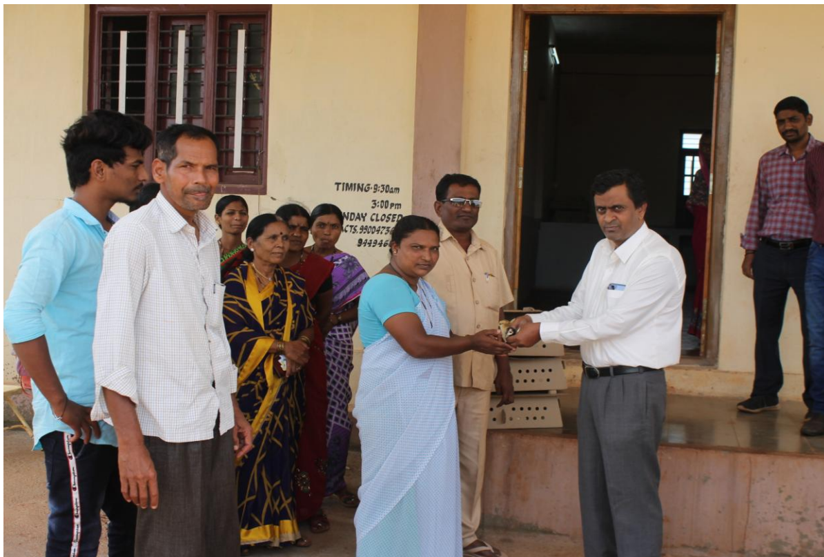
Distribution of chicks by Dean, Veterinary College, Bidar

that they were worried about the lockdown situation and did not plan to take risk by rearing those birds during lockdown period.