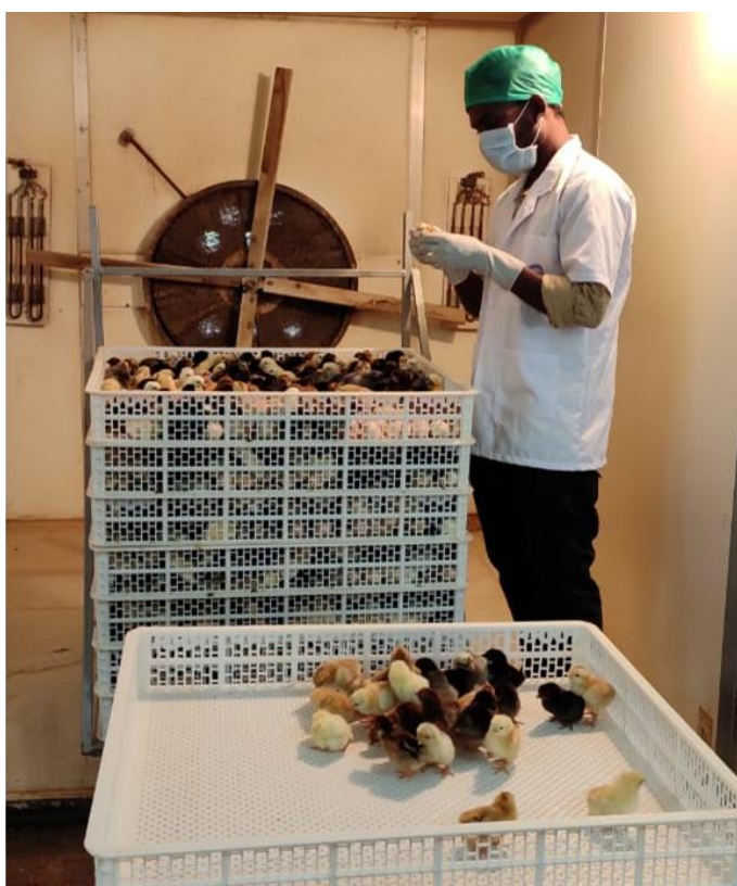
Fig. Vaccination of day-old chicks

COVID-19 lockdown restricted the availability of veterinary and input services like medicines, poultry feed, etc. used specifically for poultry birds. Since feed accounts for major cost of rearing birds, sudden lockdown closed down many feed industries/suppliers, ultimately causing decrease in production and rearing birds on maintenance basis only. Lockdown also created financial hurdles to purchasing inputs like concentrate feeds as farmers did not have cash or the inputs were not available in the local market. Due to lack of markets during this crisis, farmers had to rear existing birds for extra period with more investment. Most of these issues related to timely input purchase and increased investment were also noted in Veterinary College, Bidar.