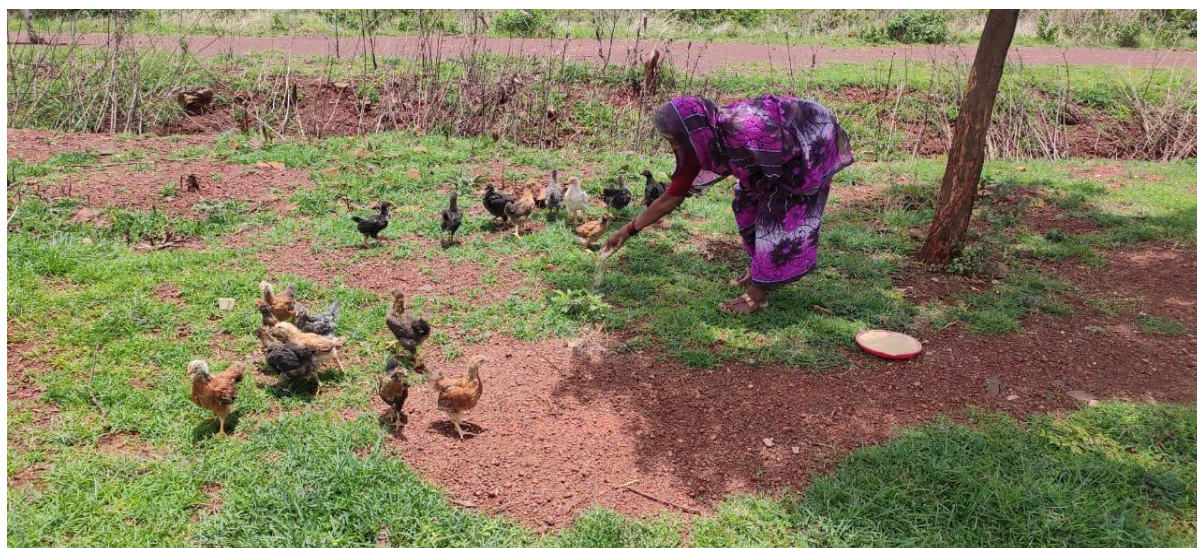
Backyard poultry rearing

During the initial phase of COVID-19, poultry farmers and sellers received reduce prices in the market compared to high production cost, ultimately leading to heavy losses to the poultry sector. The poultry breeders association estimated a loss of 22,500 crore rupees during mid-February to April ( https://www.outlookindia.com/newscroll/covid19-outbreak-poultry-sector-faces-rs-225k-crore-loss/1790419 .) Further, unorganized poultry sector, also referred to as backyard poultry, which plays a key role in supplementary income generation and family nutrition to the poorest of the poor (Rathod, 2020), has also suffered heavy losses during this pandemic.