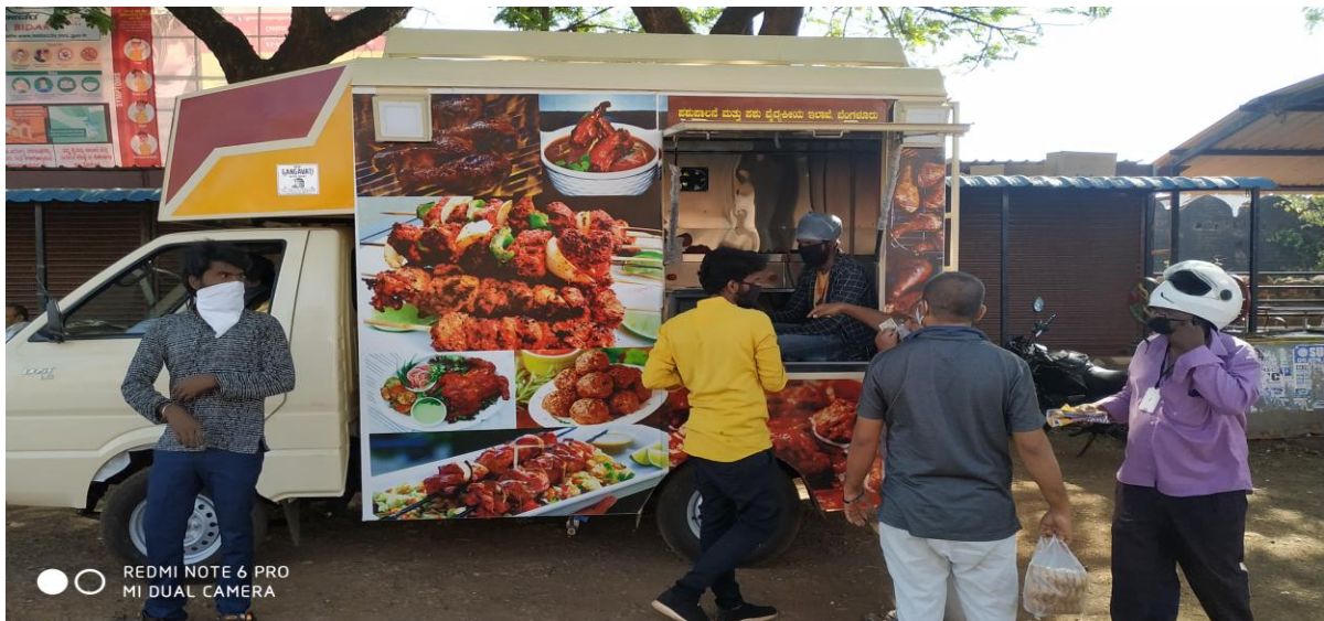
Mobile van facility “meat on wheel” for meat consumers

During lockdown period, all the meat shops were closed in the district. In this context, Department of Animal Husbandry and Veterinary Services, Bidar, and Karnataka Sheep and Wool Development Board initiated a mobile van facility “meat on wheel” for meat consumers which delivered meat while following distancing measures. Although Veterinary College, Bidar, could not be a partner in this initiative directly, it advised farmers to sell their birds to these units. Through this model, many farmers could sell their birds while consumers could get good quality meat.