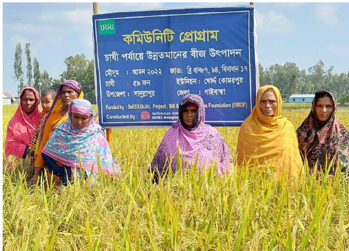
Seed Production Plot in Gaibandha

Food security is paramount in Bangladesh, which has a high population density (1329 people per km 2 ) and poverty rate (18.7%). Seed is a critical input in agriculture. The timely use of quality seeds of potential varieties can increase yields by up to 25%. Currently, about 46% of the farmers in the country use quality seeds, both due to a lack of awareness of the right varieties and their potential, and their timely availability. Therefore, ensuring the supply of good quality seeds is essential, and for cereals in particular. In general, seed systems promote limited high-yielding varieties which have been gradually eroding crop diversity. Location-specific evaluation and adoption of appropriate varieties can address this concern.