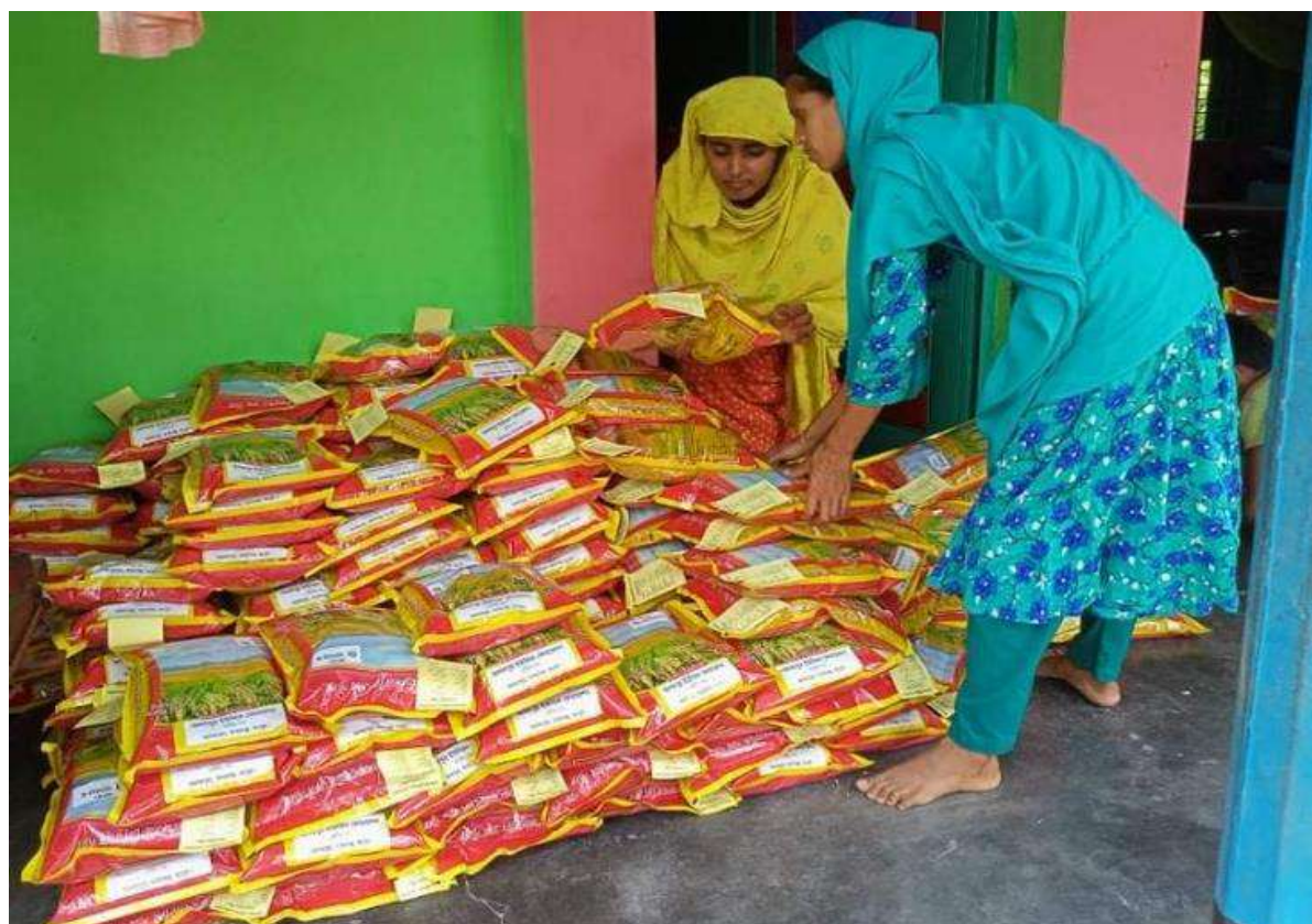
Alampur Federation Members preparing seed bags for sale

The enhancement of their knowledge of quality rice seed production is one of the most direct impact on the women group members as this will be diffused to other farmers in the region and create an environment for a self-driven seed system. Between 2019 and 2022, the Khoddokomorpur women's seed producer group produced nearly 18,000 kg of high-quality seeds of new varieties that reached 6,000 farmers. The Alampur group produced 14,000 kg of new and improved varieties which were purchased by 2,900 farmers.