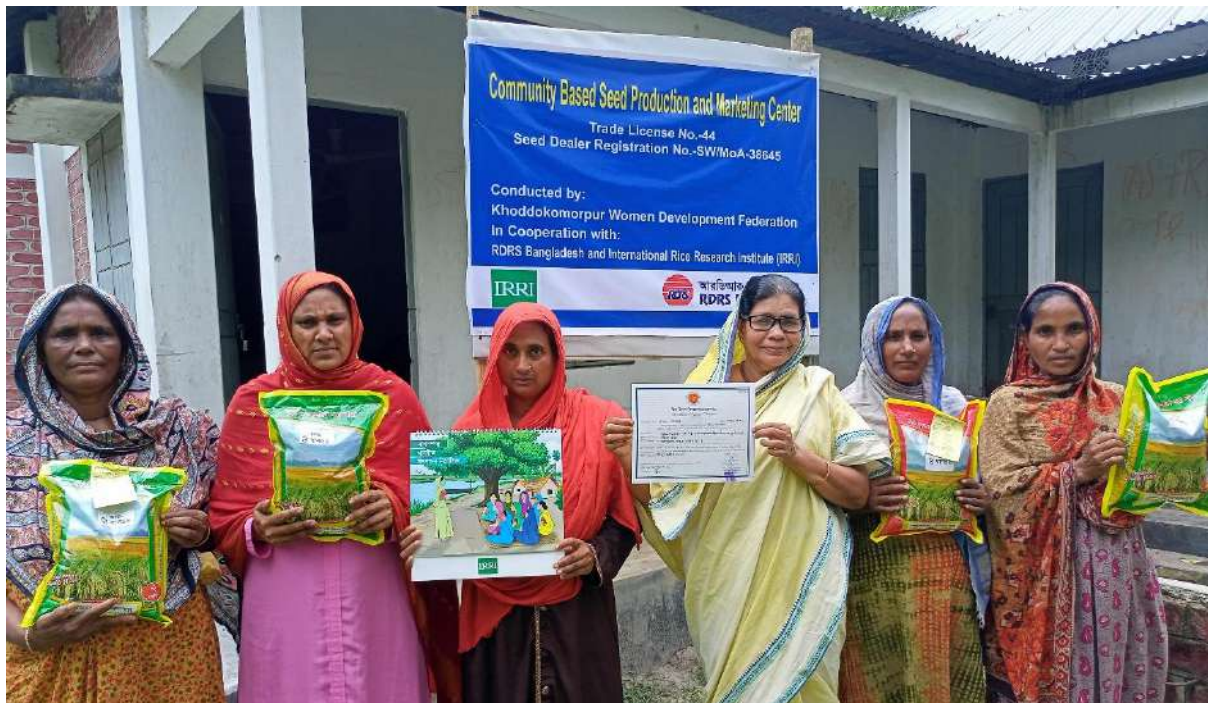
Khoddokumarpur women producer group

Organizing practical sessions was another tool that allowed hands-on experience for the trainees who were provided with training manuals and visual aids like flip charts to enable comprehension irrespective of their reading skills. Many of the participants had a better recollection of the visual materials.