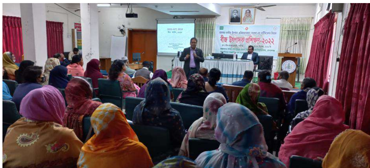
Training on Seed Certification organized by Seed Certification Agency at Gazipur

Seed marketing is another important aspect of the seed production business as sales proceeds are used to recover costs incurred in the previous season as well as to invest in the following season. Therefore, the groups are also educated on seed certification and licensing processes and linked with the Seed Certification Agency (SCA) and dealers. Seed certification helps in branding and commercial marketing and ensures better returns. Both groups obtained the license for certified seed production from SCA after successful quality monitoring protocols. Apart from RDRS and SCA, IRRI has partnered with government bodies like BRRI and BINA for the supply of nucleus and breeder seeds to the farmers, and with BADC for foundation seeds. BADC also engages seed producers as contract growers for the procurement of certified seeds to meet the demand in the region.