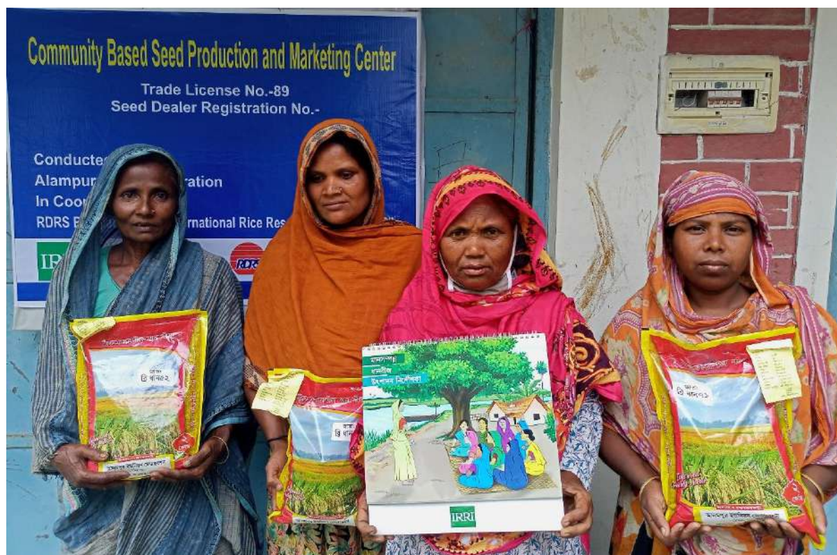
Alampur women producer group

Beyond technical training, the project placed emphasis on team building, communication skills, and decision-making abilities. Such abilities are considered imperative while choosing presidents, secretaries, and other important members. IRRI and RDRS also aided the groups in the election of their leaders, treasurer, secretary, and members of the Seed Management Committee (SMC) for the smooth and efficient functioning of the seed production business.