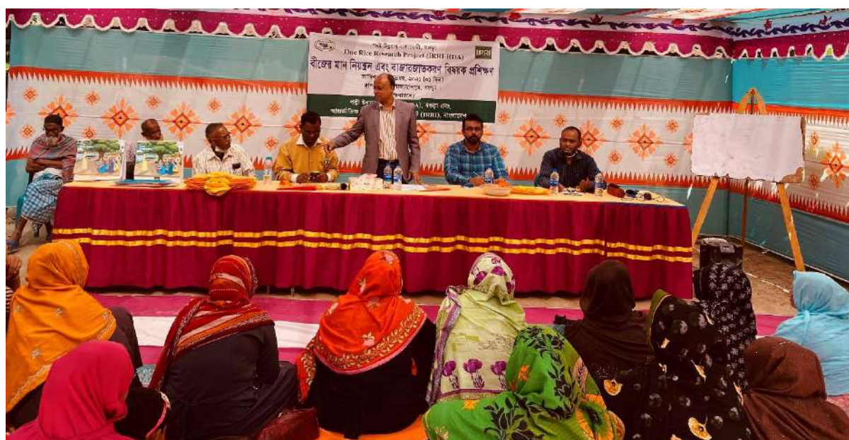
Training on Seed Storage by RDA at Bogura

In the same year, IRRI started training two groups -- Khoddokomorpur Women Union Federation in Gaibandha district and the Alampur Union Federation in Rangpur district – comprising of 100 women members each. The members of were chosen based on their farm size, cropping patterns, experience in rice seed production and marketing, and involvement in previous training. The trained groups realized the potential of rice seed-based businesses and were motivated to engage in the seed-based business as it would help them access quality seeds and crucial information and guidance during crop production.