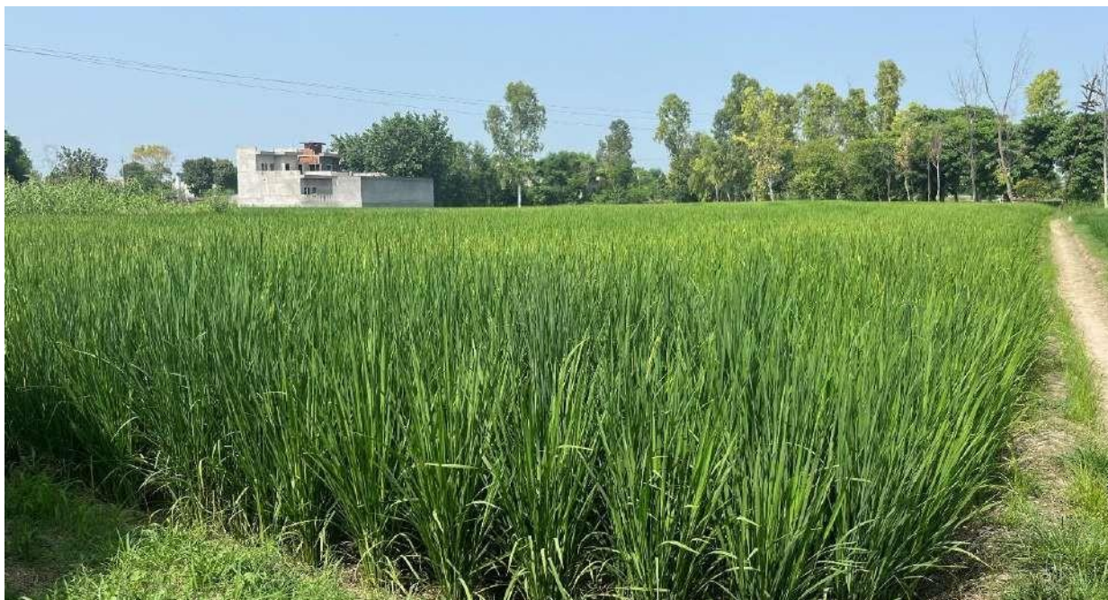
Farmers who adopt direct seeded rice (which improves water use efficiency) and no tillage practice (which conserves soil organic biomass) are eligible for getting carbon credit

This approach provides farmers with a financial incentive to adopt sustainable practices, such as not burning residues. By participating in such initiatives, farmers contribute to climate change mitigation efforts while also potentially improving their own livelihoods. The involvement of a third-party verifier helps ensure the integrity and credibility of the process, providing assurance to all stakeholders involved.