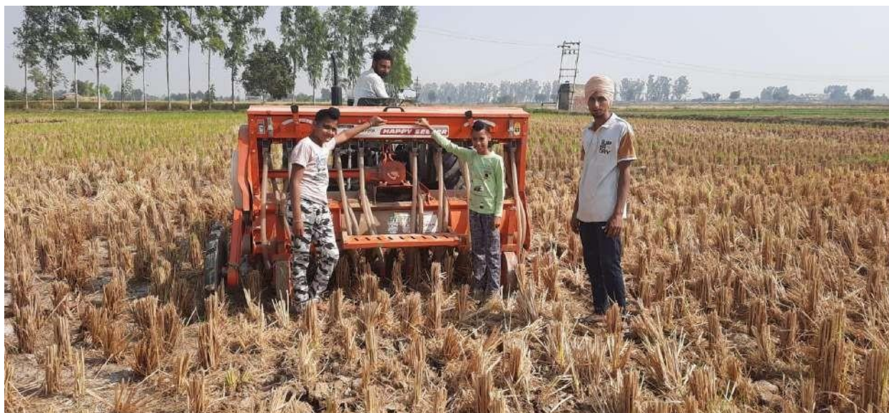
Happy seeder is an ideal solution to the problem of crop residue burning as it helps reduce GHG emissions

As on 26 September 2023, a total of 41 agriculture land management projects are listed in the Verra registry 3 with an annual estimated emissions reduction of 27 million tons CO 2 e. This reduction is equivalent to getting 6 million gasoline-powered passenger vehicles off the road for a year 4 . This converts to 27 million carbon credits, the value of which might be around INR 2200 crores (@US$ 10 per carbon credit 5 ). Assuming 60% of this reaches farmers, it amounts to around INR 1300 crores. This amount is equivalent to the combined budget allocated for Central Sector Schemes/Projects, like the formation and promotion of 10,000 Farmer Producer Organizations (FPOs) and Agriculture Infrastructure Fund (AIF) 6 .