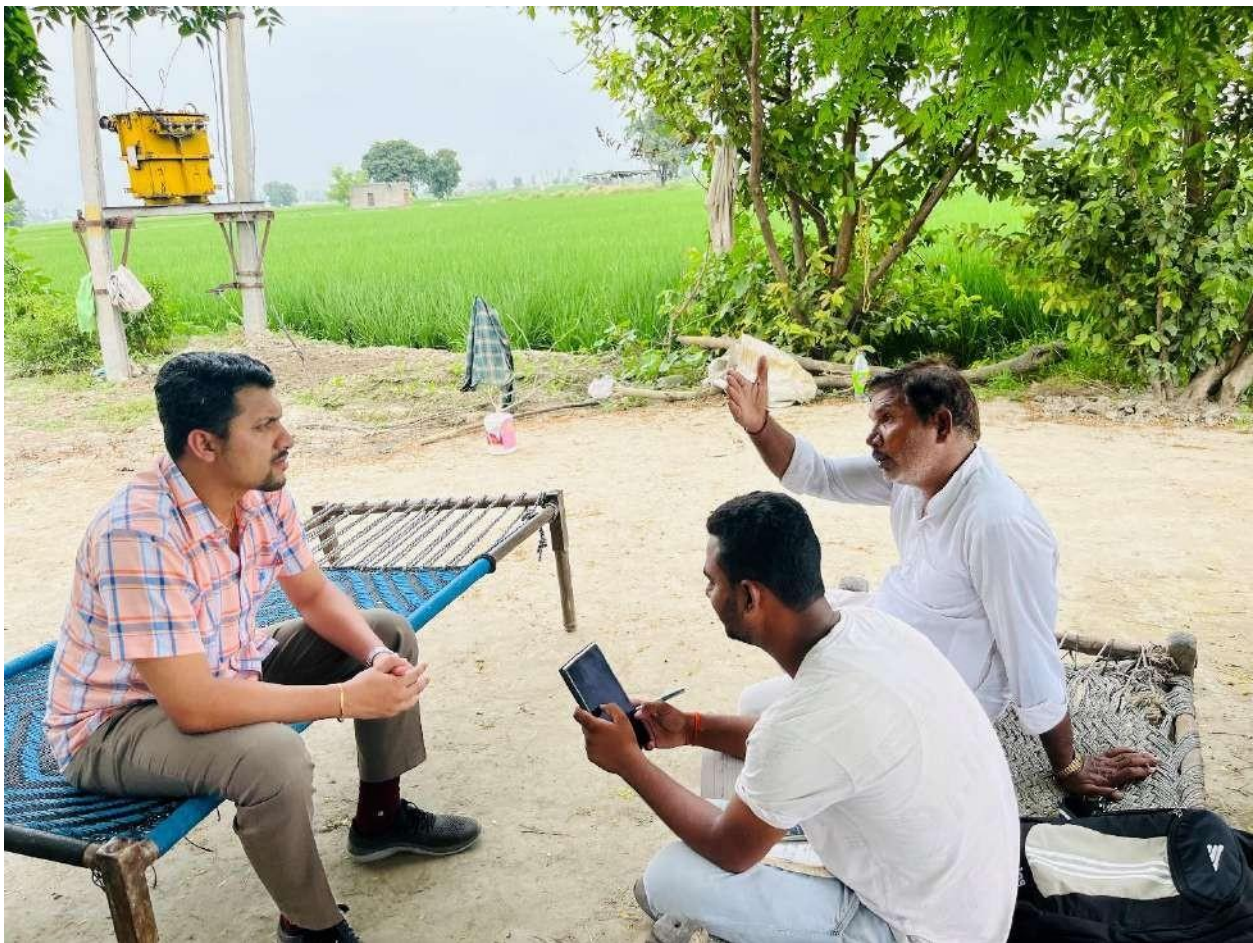
Interviewing a carbon farmer in Haryana

Preliminary findings from the survey of carbon farmers 7 conducted by CIMMYT in 2 states of India covering 7 carbon credit projects revealed that a major share of farmers enrolled in carbon farming projects did not receive any kind of training on the interventions. Also, farmers had little knowledge about the written/digital contract with the company, ownership of carbon credits generated and the whole process of carbon crediting. Furthermore, most of the farmers highlighted that the company did not contact them or share any information after they had enrolled in the project. These observations underline the need for training and farmer engagement for the success of individual carbon farming projects and the larger goal of climate change mitigation. Thus, proven models of agricultural extension should be used by the companies who could hire qualified extension professionals or devise context-specific strategies for better engagement, information sharing and training of farmers.