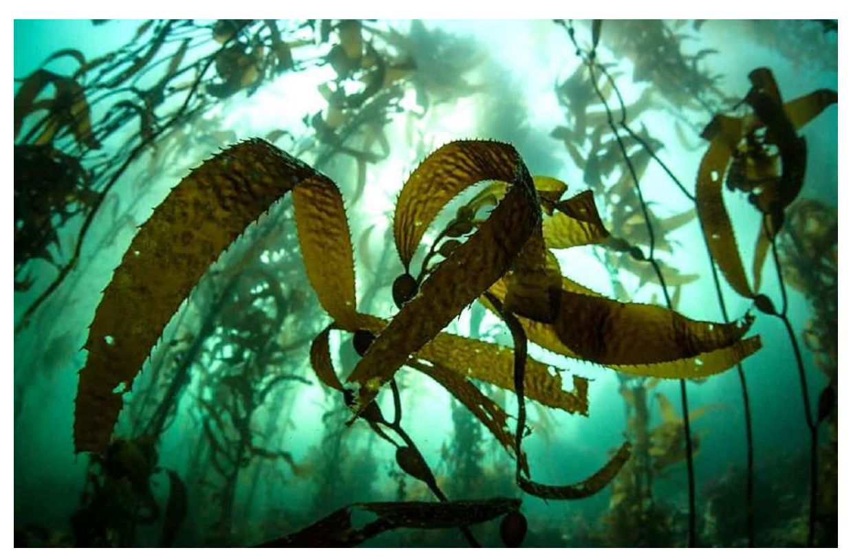
A marine forest, off the coast of northern California, dominated by fast growing giant kelp

Seaweed has learned to survive all over the earth – from opaline glaciers to sun-scorched lagoons, from salt-saturated seas to freshwater rivers. It adapts well to all environments and in all geographical conditions. The writer refers to them as 'nutritional bombs' loaded with fibre and micronutrients. They are low in fat and contain Vitamins A, C and K; as well as Iron, lodine, Magnesium, Phosphorus and Zinc. They also contain Vitamin B12 and Omega-3 fatty acids (EPA and DHA).