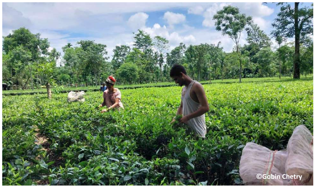
Workers plucking tea leaves

Tea growers face a lot of problems. Fluctuation in price of the green leaf is one of the most important challenges faced by small tea growers. Our constant demand is for a fair and remunerative support price for tea, but to date this demand has not been accepted. Though the Tea Board has initiated a price sharing formula and announced a minimum benchmark price, at the field level this is simply not working.