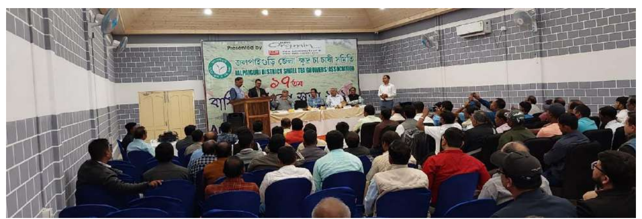
District Small Tea Grower Association's meeting at Jalpaiguri

In Assam, recently The Hon'ble Chief Minister conducted a meeting with the small tea growers, BLFs, and other stakeholders. He boldly supported the small tea growers, which was a great thing for us. In West Bengal too we had similar meetings in April. I am hopeful that all over the country the scenario is slowly changing, and the governments are coming out in support of the tea growers as tea cultivation is creating huge employment in the rural areas.