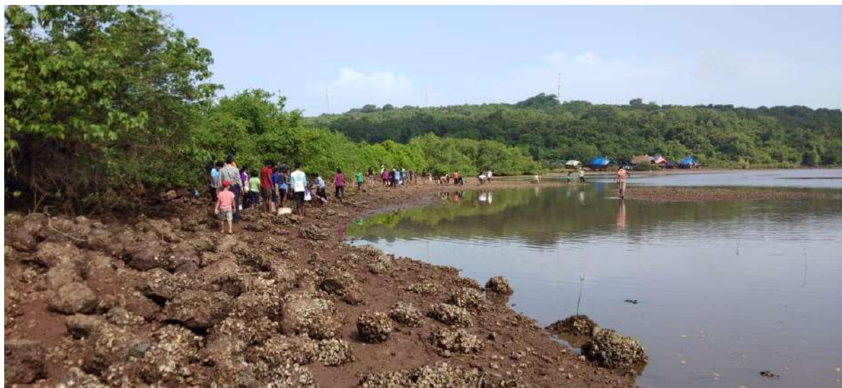
Intertidal coastal habitat within a marine landscape, Mirya mangrove ecosystem (Ratnagiri)

management conservation initiatives. Without strong EAS support, many MPAs remain weakly enforced, poorly implemented and inadequately managed. It helps identify the trade-off between stringent conservation regulations and the socio-economic needs of local communities. It ensures that communities understand, support, and actively benefit from marine protection by translating abstract conservation goals into practical actions.