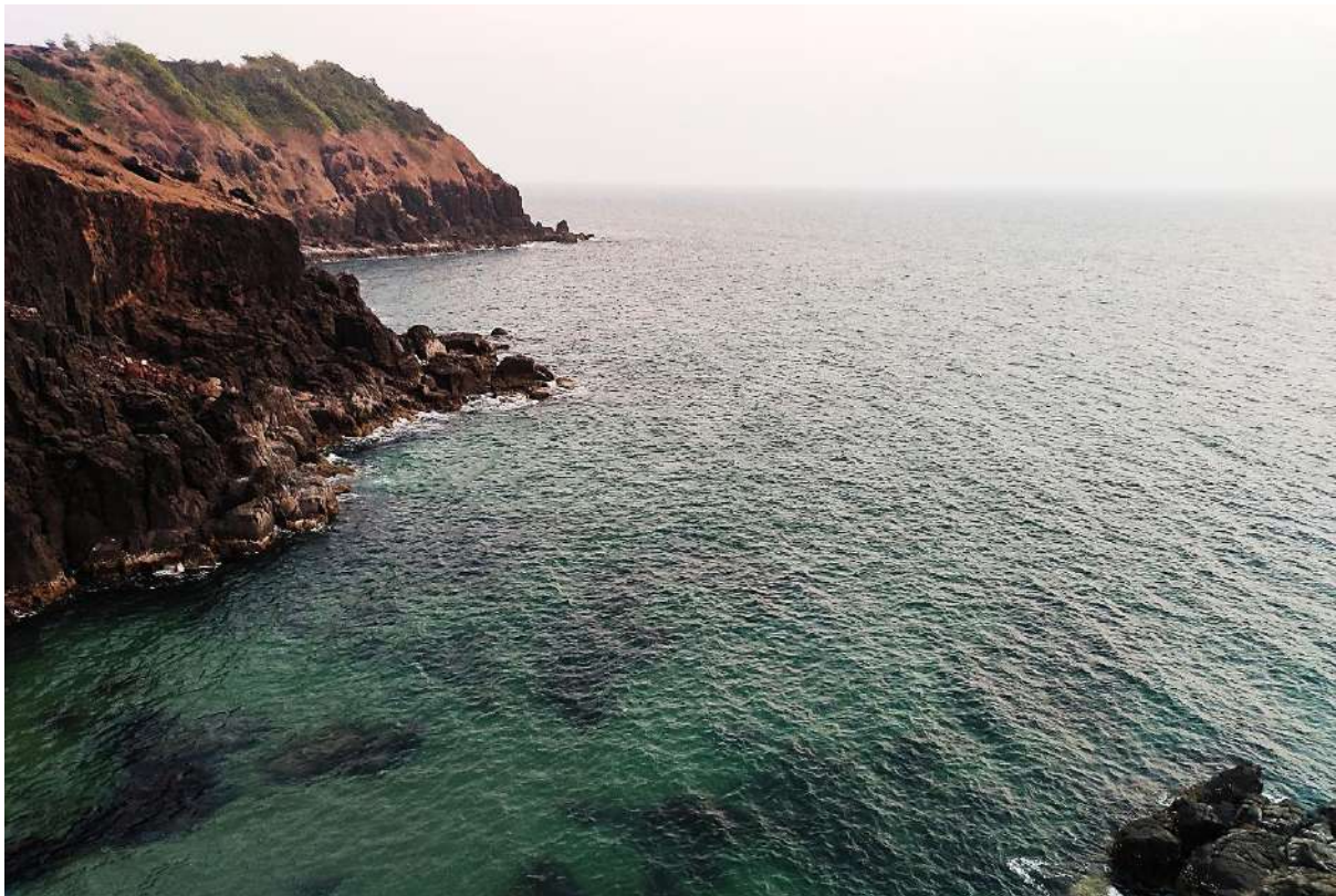
Rocky coastline affected by marine erosion and wave action Kasheli Beach (Ratnagiri)

India's fisheries and aquaculture sector is one of the fastest-growing agricultural sectors in terms of production, exports and livelihood support. However, despite significant growth in inland fisheries production, the marine fisheries ecosystem is facing increasing pressure from overfishing, mechanisation, habitat degradation, climate variability, marine pollution, coastal development, biodiversity loss, rising operational costs, declining catches, and fishing conflicts, placing small-scale marine fisheries under severe livelihood stress. In this context, promoting Marine Protected Areas (MPAs) provides opportunities to conserve marine biodiversity, restore fish stocks, strengthen coastal resilience, and sustain livelihoods.