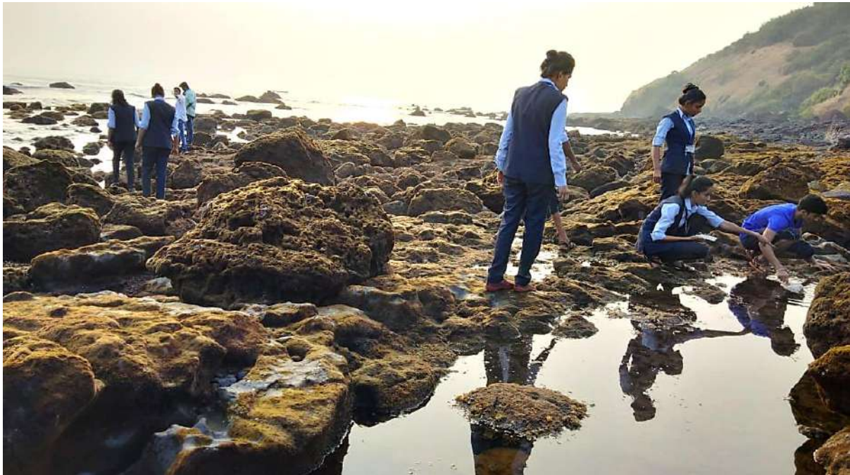
A rocky intertidal coastal ecosystem : Aare ware coastal belt (Ratnagiri)

In the Gulf of Mannar, inadequate community participation and conflicts with government agencies have weakened conservation outcomes and reduced trust among fishing communities. However, most of the extension agencies roles are challenged by shortage of staff & trained personnel, legal and jurisdictional ambiguity (no specific laws dedicated to MPAs confusing rights and boundaries), livelihood and community conflicts (Malvan Marine Sanctuary coastal communities protest), lack of strict enforcement and active management, industrial and commercial stakeholder pressures (rapid urbanization, construction, and tourism activities) and cross-departmental disconnect (poor coordination between the core regulatory and implementing agencies like forest and fisheries departments).