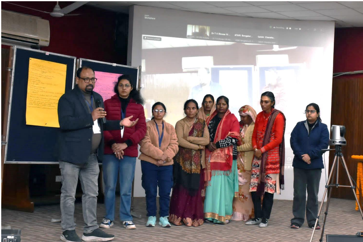
Discussion on the Holistic STIB approach to address the challenges