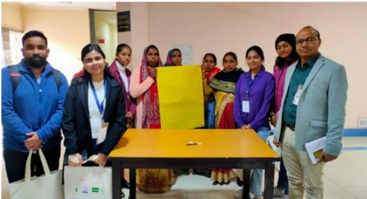
Group exercise on challenges faced by farm women in Bareilly

Participants shared challenges faced by farm women and solutions for empowerment through group discussions involving 75 members, including scholars, experts, and women farmers.