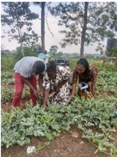
Hands-on field learning under the Farmer Field Schools (FFS) programme in Uganda.

Through this process, over 600 personnel were refreshed and equipped with practical skills, including Agricultural Innovation Systems, FFS philosophy and adult learning principles, facilitation and communication for development, community engagement and farmer group sustainability, Agro-Ecosystem Analysis (AESA) for irrigated systems, crop phenology and season-long calendars, irrigated agronomy basics, irrigation system operation and maintenance, agroecology and climate-smart agricultural practices, agribusiness, nutrition, and gender-sensitive FFS tools. Practical application of AESA and irrigation management in learning sites significantly enhanced participants' skills, confidence, and appreciation of the approach.