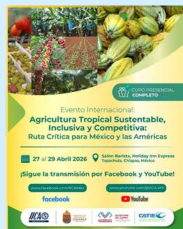
Event poster: Sustainable, Inclusive, and Competitive Tropical Agriculture (27–29 April 2026, Chiapas, Mexico).

🔗 Follow the event, through Facebook and Youtube .