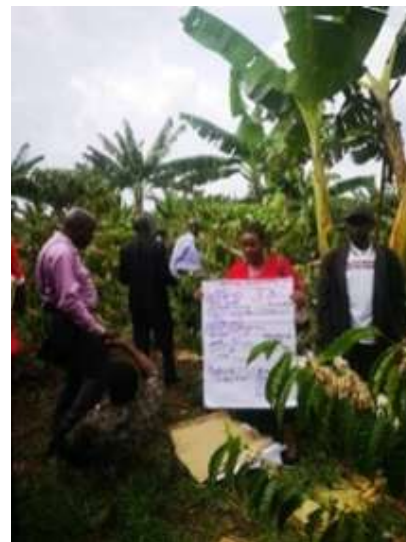
Participatory group work and knowledge exchange during FFS training sessions.