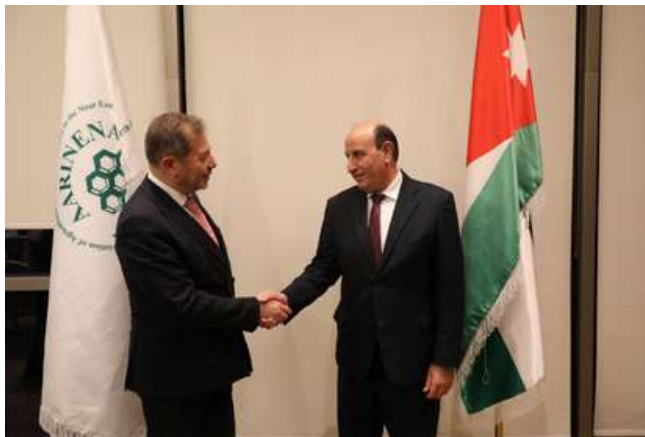
Official handover and leadership transition during the AARINENA General Assembly meeting in Amman, Jordan.