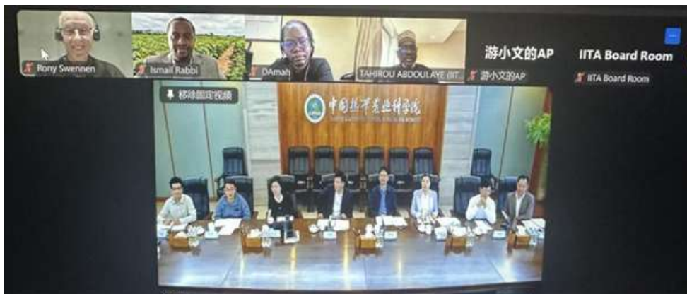
Virtual meeting between CATAS and IITA to advance cooperation in tropical agriculture research and innovation.