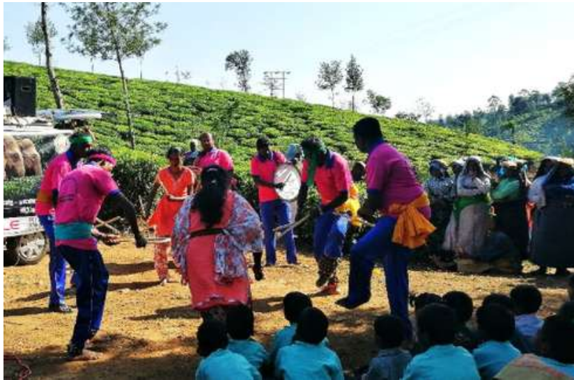
Street play organised by Nature Conservation Foundation (NCF) engaging plantation workers and school children on human–wildlife coexistence