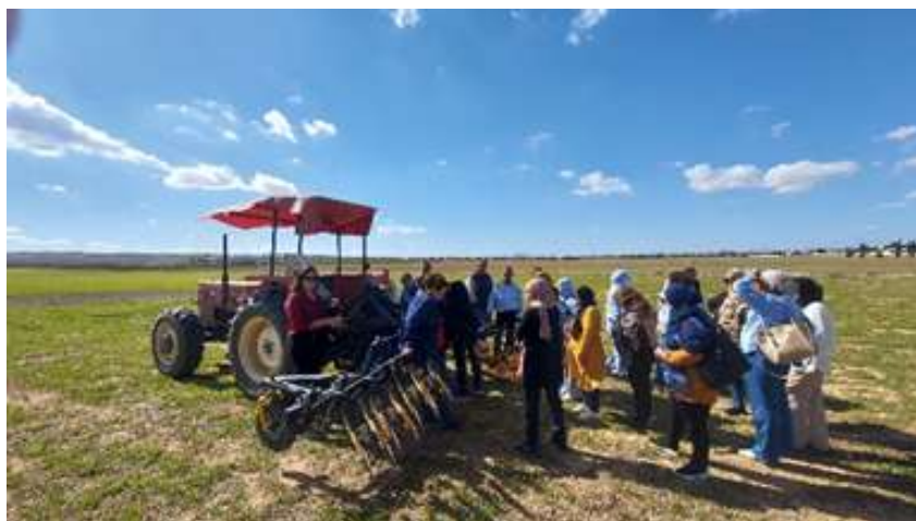
Demonstration of mechanical weed control.