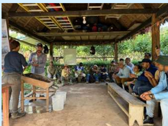
Demonstration in a training on the importance of soil health in cocoa production systems.

Read more: FiBL - Soil health in cocoa production