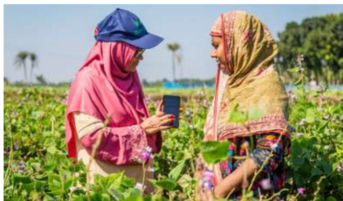
A farmer advisor sharing information via a digital tool with a female farmer.

CABI's wider work also highlights how AI can enhance the inclusivity of agricultural advisory services, including for women farmers who often lack access to reliable information. AI-enabled tools—when grounded in trusted scientific content and delivered through accessible formats such as voice and local language—offer significant potential to close gaps in access, strengthen pest-management decision-making and reduce the reliance on intermediaries. Click here to know more.