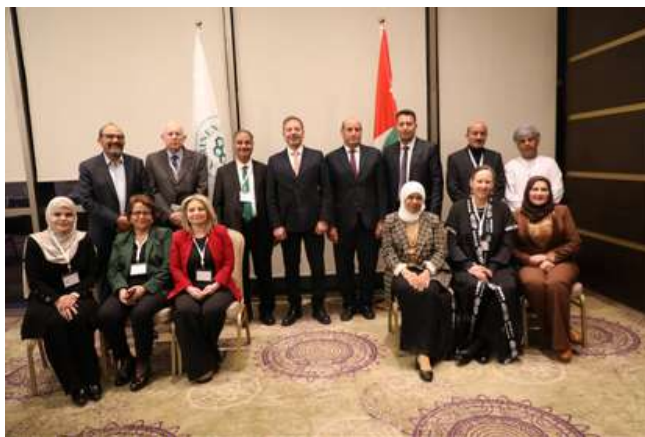
Members of the AARINENA Executive Committee and participants at the General Assembly meeting.