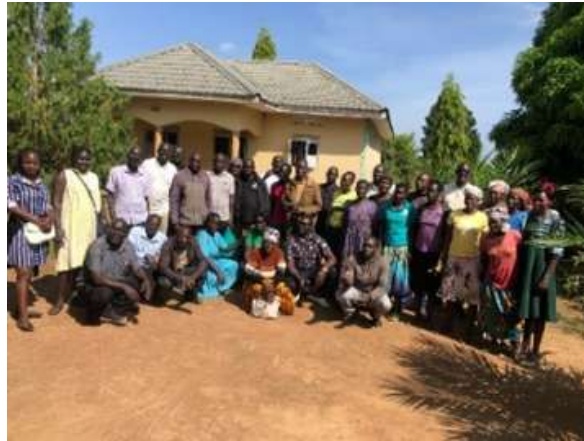
Participants and trainers of the FFS rollout programme under the UgIFT initiative.