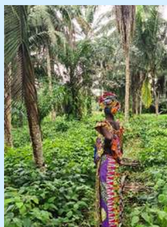
Organic coconut production in Cote d'Ivoire.