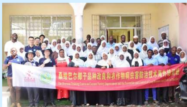
Participants and trainers of the overseas training course on coconut improvement and pest control in Zanzibar.

Minister Makame welcomed CATAS's contribution and called for stronger collaboration to enhance Zanzibar's tropical agriculture productivity and processing capacity. A Memorandum of Understanding was signed between CATAS and the Zanzibar Agricultural Research Institute (ZALIRI) to formalize future cooperation in germplasm conservation, cultivation, and food safety. The hands-on training covered 12 technologies tailored to Zanzibar's fruit and spice sectors, supporting practical application and long-term impact.