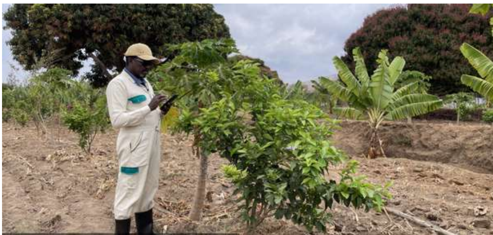
Farmer using a mobile device for crop advice.