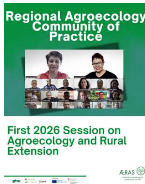
Participants of the Regional Agroecology Community of Practice during the first 2026 session on agroecology and rural extension, held online on 19 February 2026.

The session also highlighted practical innovations, including the use of locally produced bio-inputs (e.g. bokashi, bioles), the establishment of community seed systems, and actions to support pollinators and biodiversity.