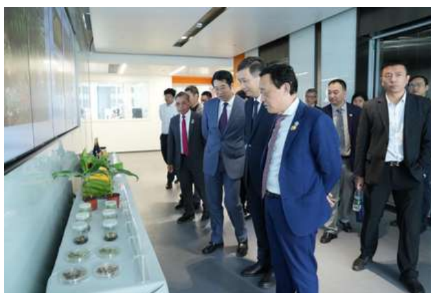
FAO Director-General visits CATAS and reviews advances in tropical crop research and breeding technologies.

The visit strengthened dialogue between FAO and CATAS and opened new opportunities for technical collaboration in support of global food security and agricultural transformation in the Global South.