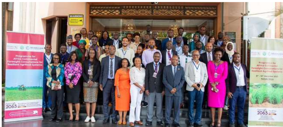
Participants of a continental foresight consultation on resilient agrifood systems, contributing to long-term planning and policy dialogue in Africa.

Supporting these developments is a growing layer of knowledge and learning infrastructure. Digital platforms, monitoring and evaluation systems, and harmonised training resources are being strengthened to ensure that data and experience translate into action. Regular coordination processes are helping institutions move from fragmented knowledge flows to continuous learning systems. This transformation also reflects the complementary roles of multiple partners, including the African Union Commission, FAO, the African Development Bank, the European Commission, GIZ, and IDRC.