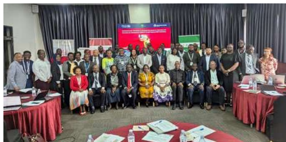
Participants during a multi-stakeholder workshop on agricultural innovation systems, bringing together policymakers, researchers and development partners.

Foresight is also moving from the margins to the centre of decision-making. Through collaboration between the African Union Commission, the United Nations Food Systems Coordination Hub, and technical partners including FAO, a continental foresight process is underway to address a defining question: How will Africa feed 2.5 billion people by 2050? This work combines horizon scanning, political economy analysis, and scenario development to inform policy and investment choices under the CAADP Post-Malabo (Kampala) Strategy and Action Plan (2026–2035). In parallel, a wider foresight ecosystem is emerging, helping link long-term scenarios to present-day decisions and contributing to anticipatory governance.